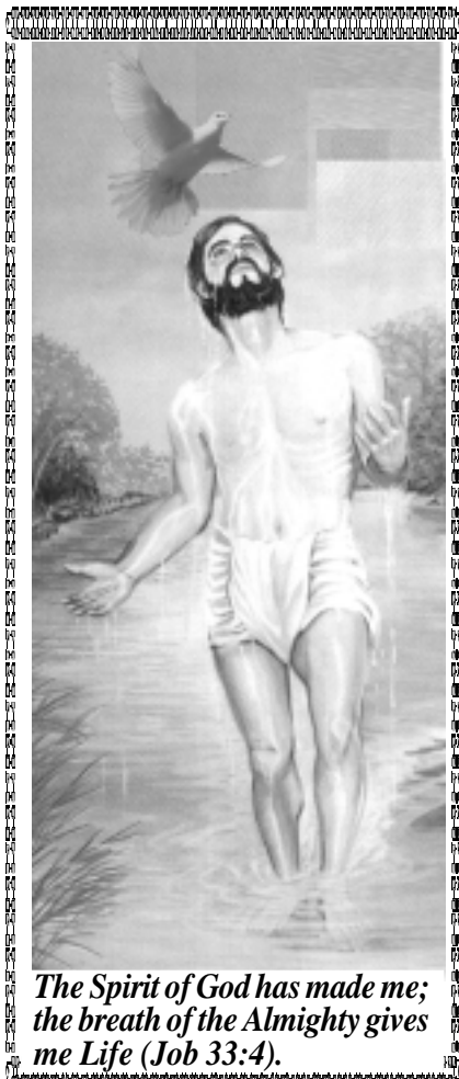
The Spirit of God has made me; the breath of the Almighty gives me Life (Job 33:4).

Apostle Paul recognised the importance of the Holy Ghost in the life of a christian, hence he asked the disciples he met at Ephesus if they had received the Holy Spirit when they believed (Acts 19:1-6). Jesus Christ referred to the Holy Spirit as another Comforter (John 14:16). The apostles knew Jesus Christ as they knew the Holy Ghost, because the two are much alike and inseparable. Jesus Christ sent the Holy Ghost unto the disciples as “Another Comforter.” In a sense, the Holy Spirit was to take the place of Jesus Christ who was the First Comforter. Are you a christian without the baptism of Holy Ghost? Further still, is it really possible for one to be baptised in the name of